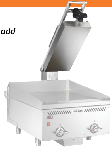
VMCS-101 Shown with GADJUST-ROTARY mounted to a VCCG24 Griddle.