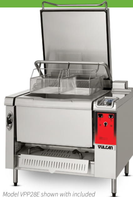
Model VPP28E shown with included strainer and optional baskets (VPP-BASKET)