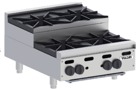
VHP424U (Step Up Series)