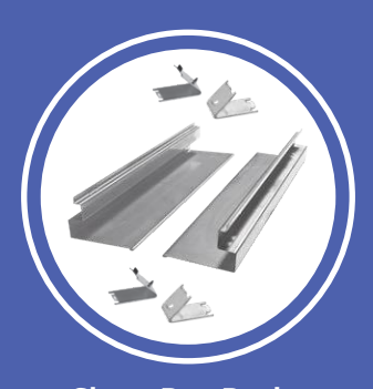
Sheet Pan Racks Optional sheet pan rack assembly fits full-size pans..