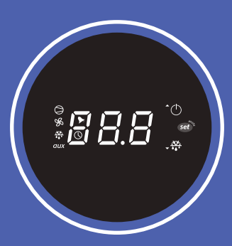
Digital Control Easy settings with audio and visual overheat alarm.