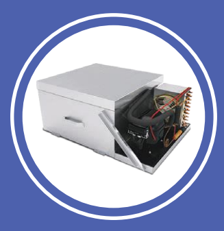
Blizzard R290 EPA/DOE approved, all-in-one, slide-out cooling cartridge.