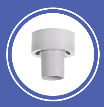
Vacuum Relief Valve Equalizes cabinet pressure for smooth door re-entry.