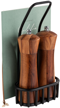
URBAN Salt and Pepper Mill 3pc Set Item No. APS 40416 L4¼" W3¾" H 9½" 3 pc. set / 1.85# - .09 cu. ft. SCC B404168