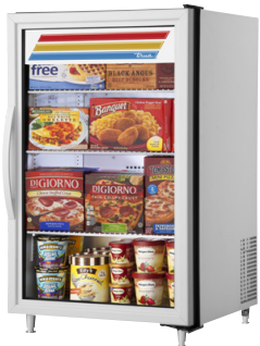
Standard White Exterior