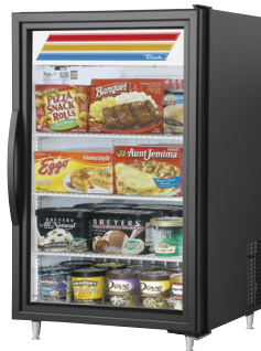
Optional Black Exterior