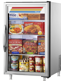
Optional Stainless Exterior