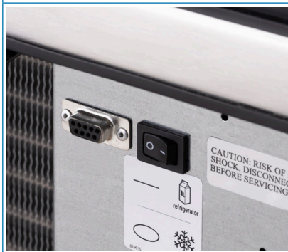
Refrigerator/Freezer Toggle Switch located Behind the Grill