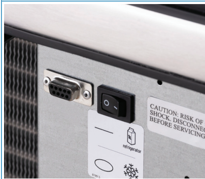
Refrigerator/Freezer Toggle Switch located Behind the Grill