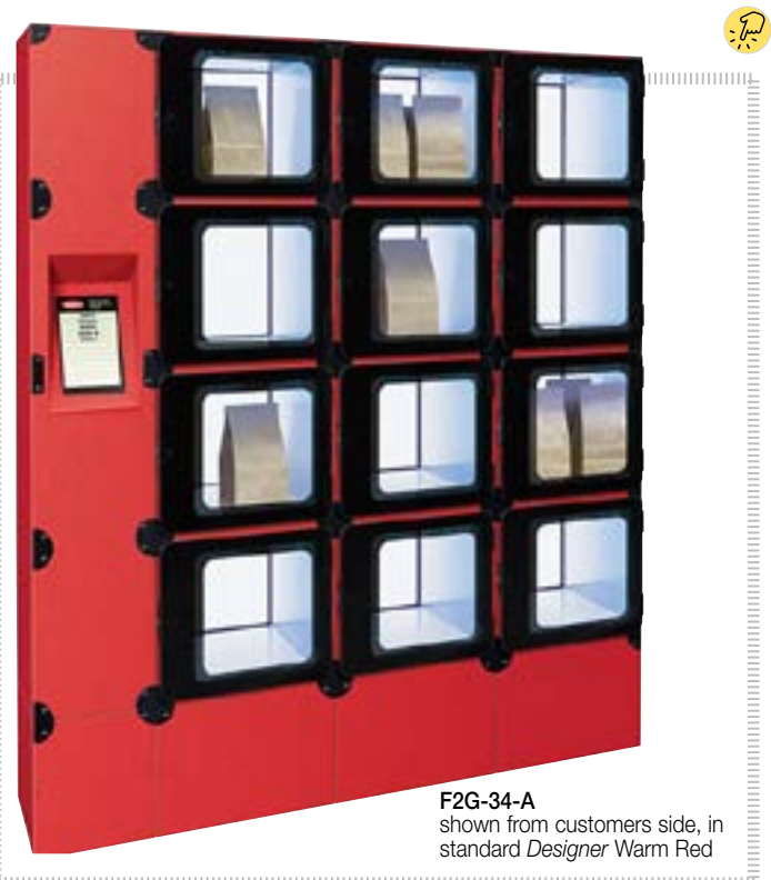
F2G-34-A shown from customers side, in standard Designer Warm Red