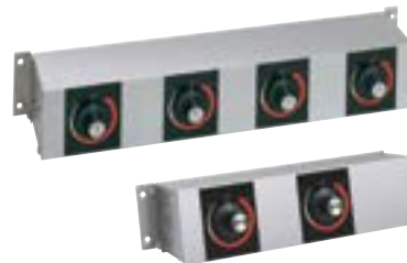
RMB-14E with infinite controls