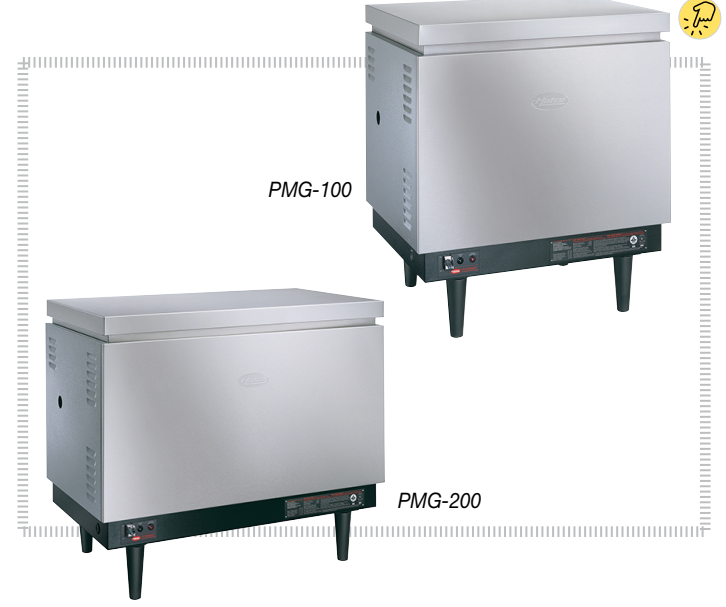
Options (available at time of purchase only)