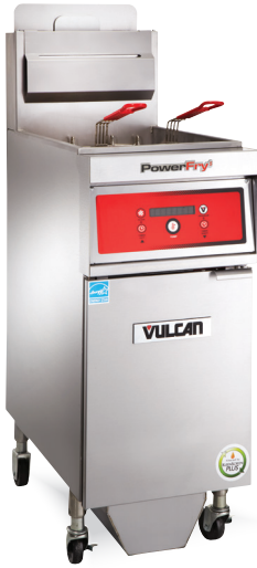
1VK45DF shown with Solid State Digital (D) controls, Kleenscreen PLUS filtration

FASTER RECOVERY FOR SHORTER COOK TIMES FROM VULCAN'S MOST ENERGY-EFFICIENT FREESTANDING FRYERS