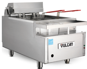
CEF40 shown with optional legs

Industry's first ENERGY STAR® certified 40 lb countertop electric fryer uses less energy resulting in lower energy bills and may qualify for rebates.