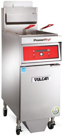
1VK45DF shown with Solid State Digital (D) controls, Kleenscreen PLUS filtration

FASTER RECOVERY FOR SHORTER COOK TIMES FROM VULCAN'S MOST ENERGY-EFFICIENT FREESTANDING FRYERS