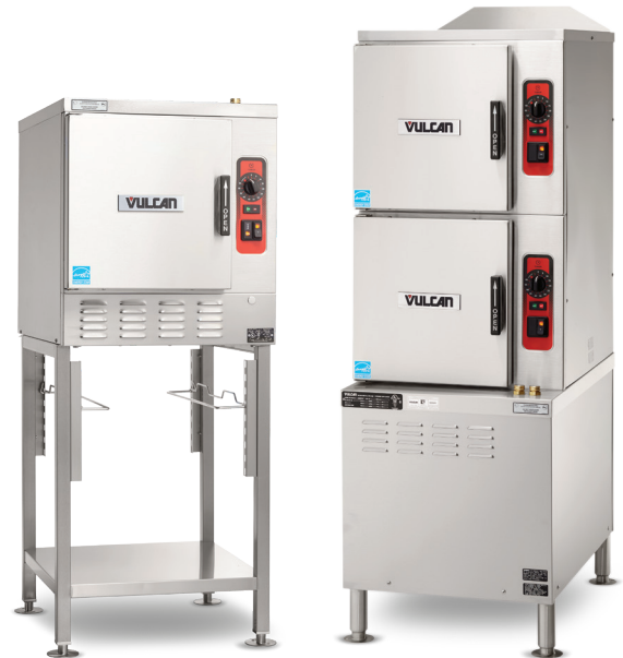
C24EA5 LWE shown on optional stand