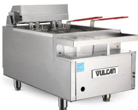
CEF40 shown with optional legs

Industry's first ENERGY STAR® certified 40 lb countertop electric fryer uses less energy resulting in lower energy bills and may qualify for rebates.