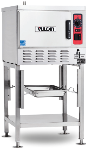
C24E03 shown on optional stand