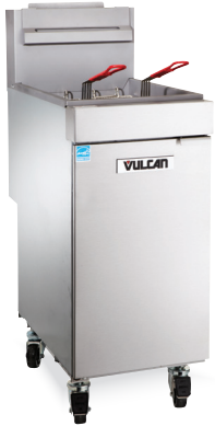
1VEG35M shown with accessory casters

Efficient fryer that uses less gas without sacrificing production rate when compared to a standard economy fryer.