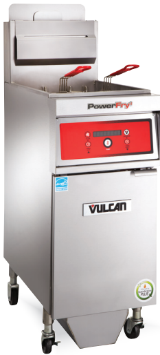
1VK45DF shown with Solid State Digital (D) controls, Kleenscreen PLUS filtration

FASTER RECOVERY FOR SHORTER COOK TIMES FROM VULCAN'S MOST ENERGY-EFFICIENT FREESTANDING FRYERS