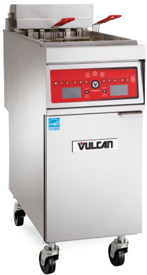
1ER50C shown with accessory casters

Ribbon style heating elements create maximum surface area for quick recovery and tilt up for easy cleaning.