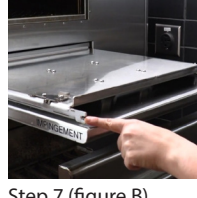
Step 7 (figure B)