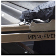
Step 3 (figure A)