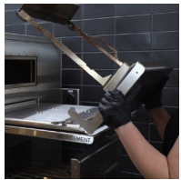
Step 3 (figure B)

⚠️ CAUTION: DO NOT soak the rapid cook door. Doing so can damage critical oven components, resulting in a non-warranty service call.