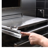
Step 7 (figure B)