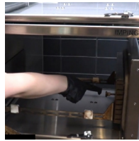
Step 7 (figure C)