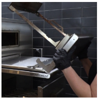
Step 3 (figure B)

⚠️ CAUTION: DO NOT soak the rapid cook door. Doing so can damage critical oven components, resulting in a non-warranty service call.