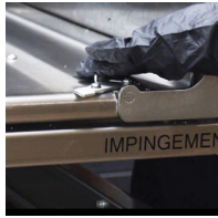
Step 3 (figure A)