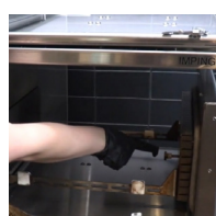
Step 7 (figure C)