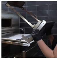
Step 3 (figure B)

⚠️ CAUTION: DO NOT soak the rapid cook door. Doing so can damage critical oven components, resulting in a non-warranty service call.