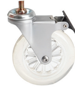
Clear Caster Option

Step 3: Add Optional Nesting Tables: Small or Medium