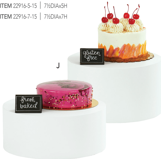
J. JUNO ROUND RISERS

ITEM 23200-125-15 | 12DIAx5H ITEM 23200-127-15 | 12DIAx7H