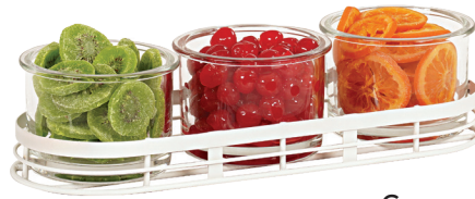
G. JUNO OVAL 3 JAR DISPLAY 3 Glass Jars Included.

ITEM 22918-4-15 | 15Wx4¾Dx4H | 16oz ITEM 22918-5-15 | 15Wx4¾Dx4H | 32oz Replacement Jars ITEM 1851-4JAR | 16oz ITEM 1851-5JAR | 32oz