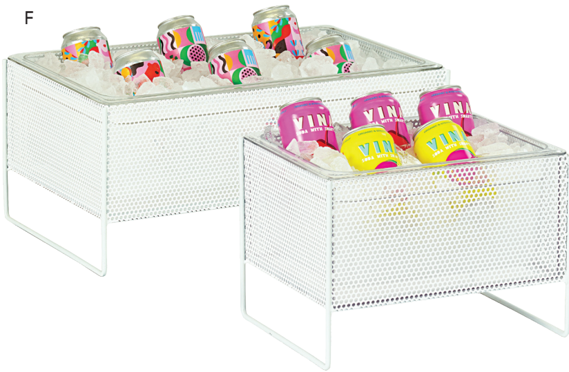
F. JUNO ICE HOUSING Includes Clear Polycarbonate Pan. ITEM 22907-10-15 | 10Wx13Dx9¼H ITEM 22907-12-15 | 13Wx20¾Dx9½H