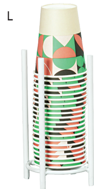
L. JUNO SINGLE CUP & LID ORGANIZER.