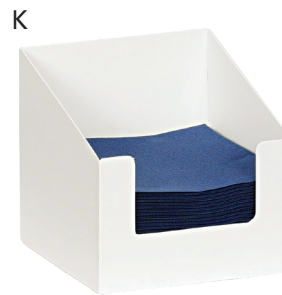
K. JUNO BAR NAPKIN ORGANIZER

ITEM 23200-125-15 | 12DIAx5H ITEM 23200-127-15 | 12DIAx7H