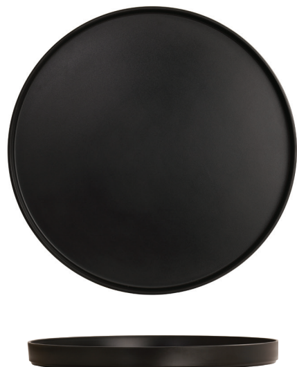
J. 16" LOW RIM PLATTER ITEM 22026-16 | 16DIAx1H Specify Color: Black (-13), White (-15), Stone Blue (-111)