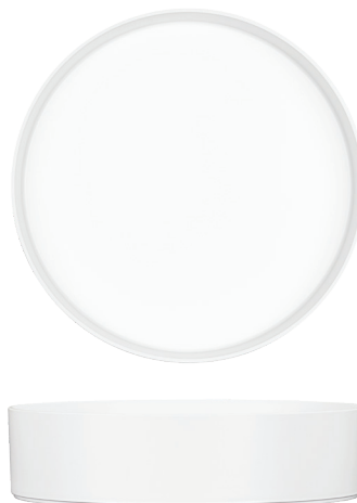
K. RAISED RIM ROUND BOWLS Specify Color: Black (-13), White (-15), Stone Blue (-111) ITEM 22500-10 | 10DIAx3½H ITEM 22550-12 | 12DIAx3H | N/A Stone Blue ITEM 22550-14 | 14DIAx3H | N/A Stone Blue