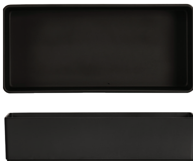
H. 13X6 RECTANGULAR PLATTER Specify Color: Black (-13), White (-15) ITEM 24004-136 | 13Wx6Dx3H