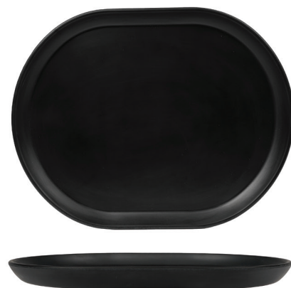
L. 14" OVAL PLATTER Available In All Colors Shown On Page 202 ITEM 22018 | 14Wx11¼DX1H