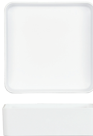
I. SQUARE RAISED RIM PLATTERS Specify Color: Black (-13), White (-15) ITEM 24002-10 | 10Wx10Dx3H ITEM 24002-12 | 12Wx12Dx3H ITEM 24002-14 | 14Wx14Dx3H