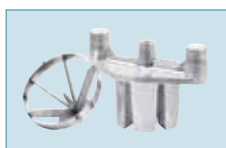
FWS-6BK Replacement wedger and blade for citrus fruits