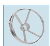
FWS-6BC Apple corer blade