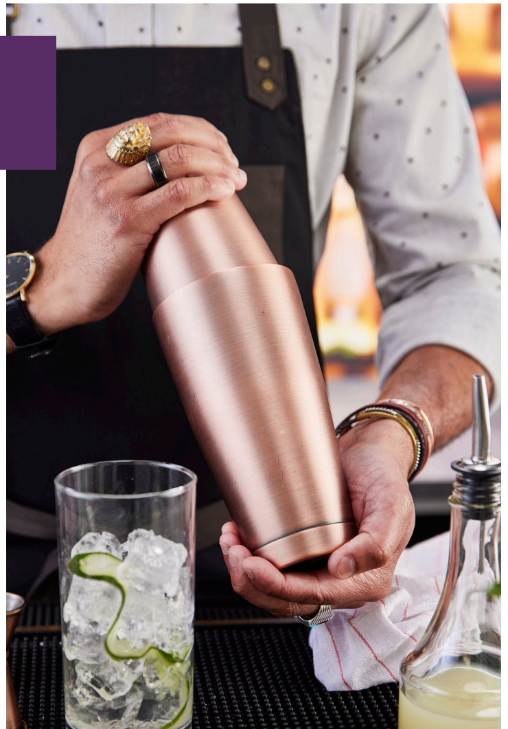
Shaken, Not Stirred