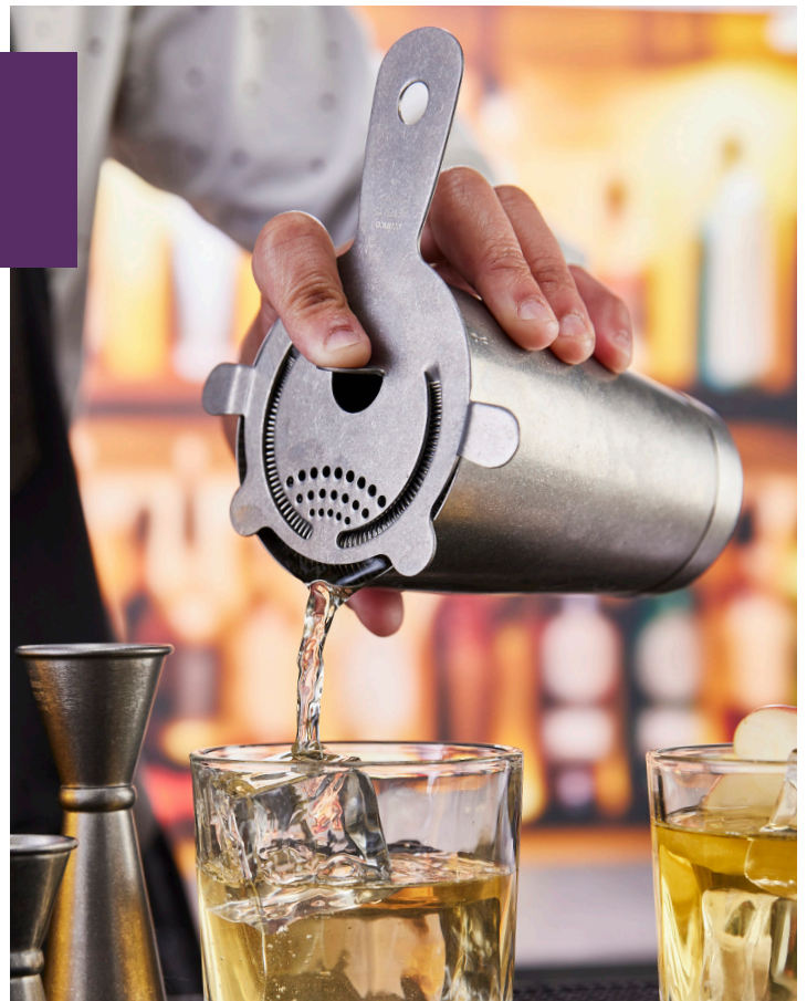
Strain and Drain