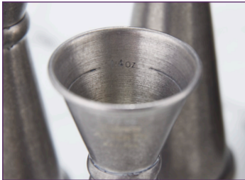
Inner fractional marks