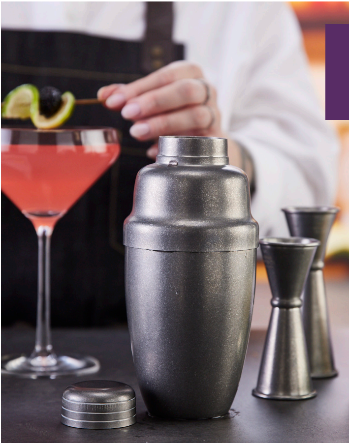
Chill, Dilute, Aerate