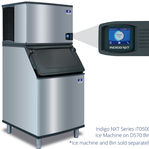
Indigo NXT Series iT0500 Ice Machine on D570 Bin *Ice machine and Bin sold separately

Designed for operators who know that ice is critical to their business, the Indigo NXT Series ice machine's preventative diagnostics continually monitor itself for reliable ice production. Improvements in cleanability and programmability make your ice machine easy to own and less expensive to operate.