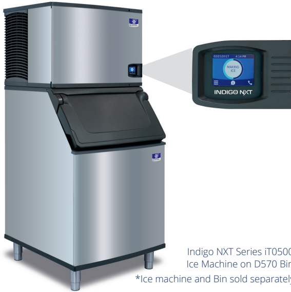
Indigo NXT Series iT0500 Ice Machine on D570 Bin *Ice machine and Bin sold separately

Designed for operators who know that ice is critical to their business, the Indigo NXT Series ice machine's preventative diagnostics continually monitor itself for reliable ice production. Improvements in cleanability and programmability make your ice machine easy to own and less expensive to operate.