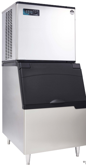
ICETRO IM-o46o ice machine on a IB-o33 bin