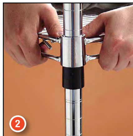
Slide shelf over sleeve for secure locking.