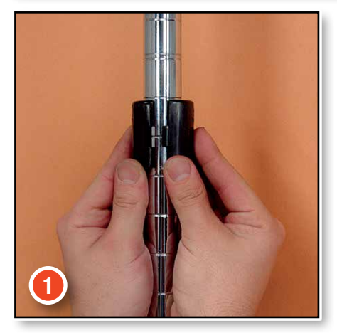
Snap plastic sleeve around post.