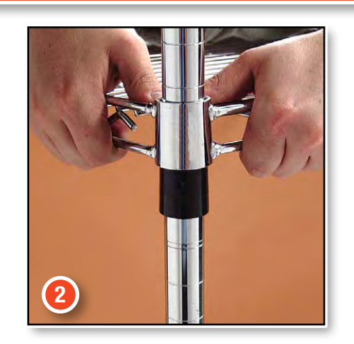
Slide shelf over sleeve for secure locking.