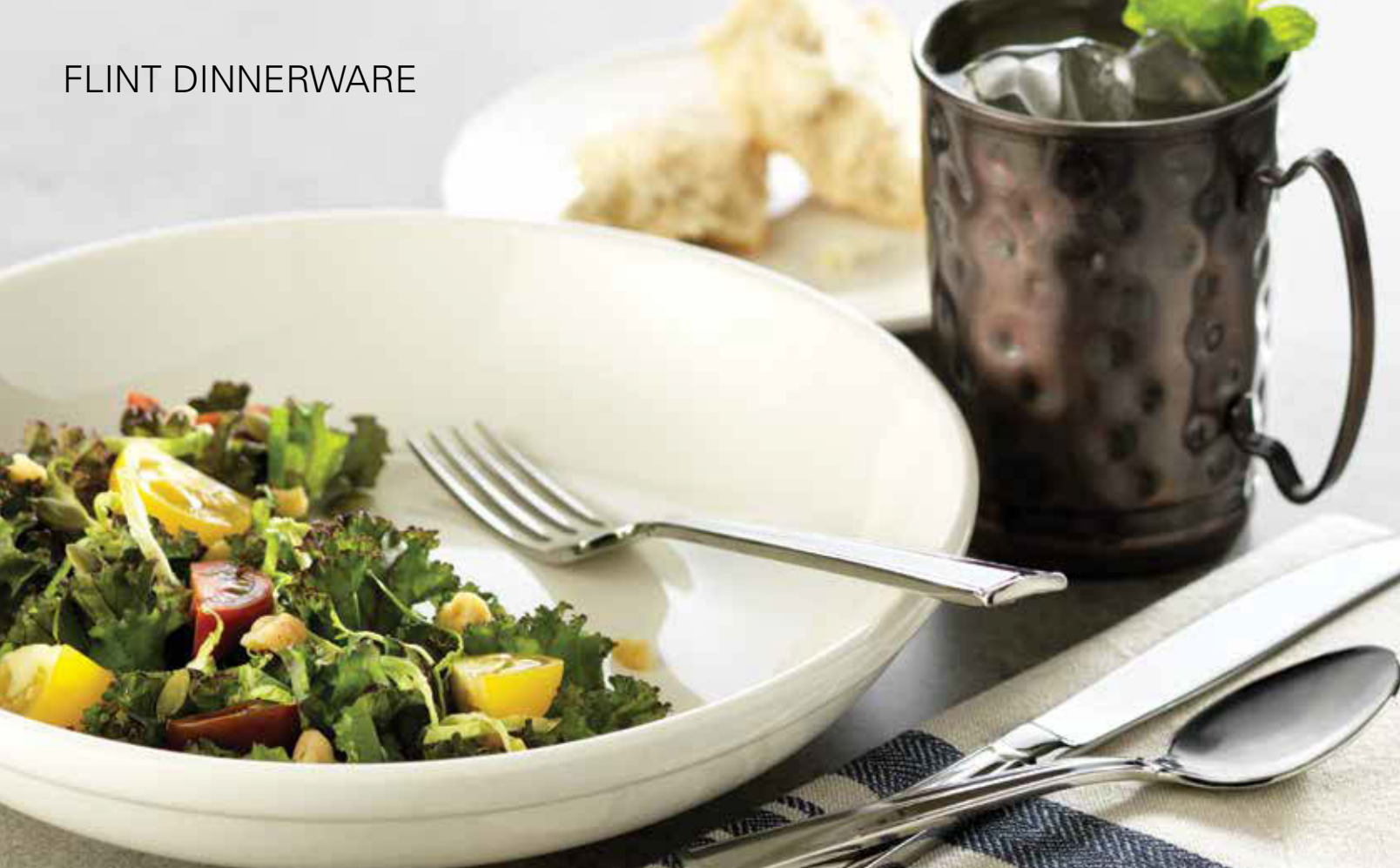
Shown: Syracuse® Flint dinnerware and World® Moscow Mule Cup