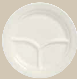
10" Compartment Plate No. 950093 763 H 1" 1 doz./29# = 1.0 cu. ft.