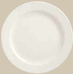
6 1/4" Frama Plate No. 951250 261 H 3/8" 3 doz./24# = .7 cu. ft.