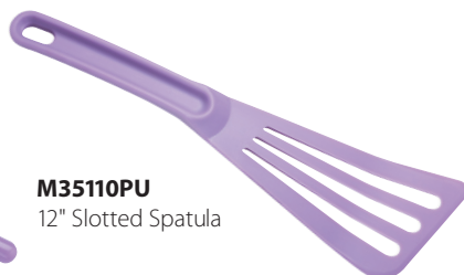
M35110PU 12" Slotted Spatula