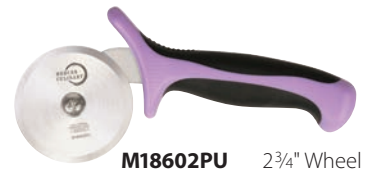
M18602PU 2¾" Wheel