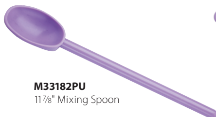
M33182PU 11 7/8" Mixing Spoon