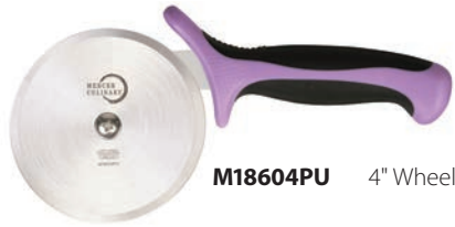
M18604PU 4" Wheel

High carbon steel blade with precision ground edges. Ergonomic and slip resistant Santoprene® and polypropylene handle. Ultra-smooth mechanism for faster and easier cutting.