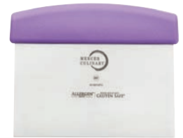
M18810PU 5 7/8" x 3 1/2"