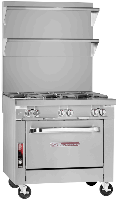
P36D-BBB w/ optional casters and flue riser.